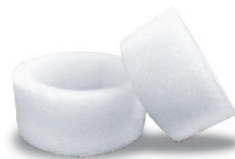
Perimeter Isolation Strip